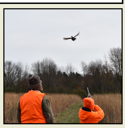
ROOSTER!!!! - This youngster knows what to do! I bet he'll be back this year!